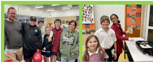
OPEN NIGHT 2021

Thank you everyone who contributed to Open Night . It was great to see a very large majority of our students and their families touring our wonderful school.