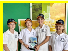
Year 6 First