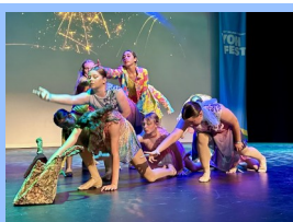
Congratulations YOH Fest Team!