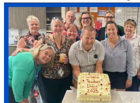
Thank you Teachers!

Thank you to our P&C and families for acknowledging our fabulous teachers on World Teachers Day .