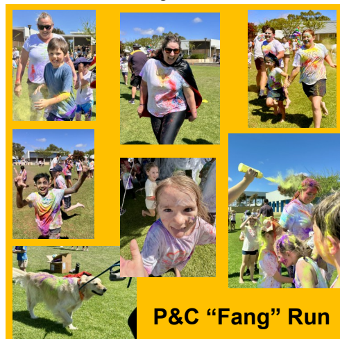
P&C "Fang" Run