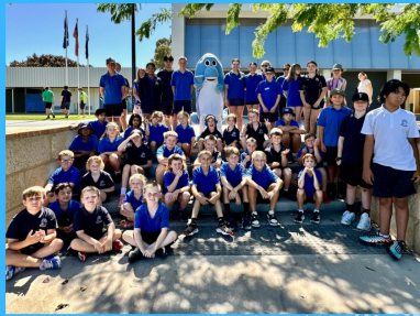
WINNERS OF THE DONGARA DHS 2025 TEAM SPIRIT AWARD