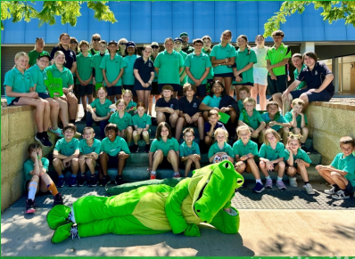
WINNERS OF THE DONGARA DHS 2025 COOTE CUP

Congratulations to Milo who were the winners of the Coote Cup . The students personal House Points are collated and this is how we determine the Coote Cup winning House.